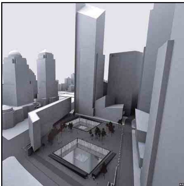
Reflecting Absence has two sunken shallow pools at its centre and will occupy the site of the World Trade Center's twin towers in New York. - Architect Michael Arad

www.greengates.edu.mx sarav@greengates.edu.mx