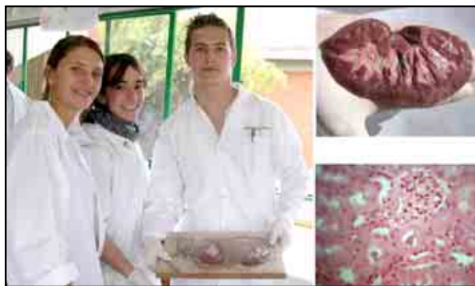
Kidney dissection with an actual microscopic observation using the digital microscope

We used the data logging in our Extended essays and the quality of the investigations has improved significantly.