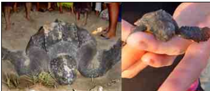
The Ecology field trip to Jalcomulco, Veracruz (17-20 June 2004)

The essential part of the I.B. Biology and Environmental System courses for all the lower sixth students. They gain first hand experience of tropical terrestrial and aquatic ecosystems, collecting and analyzing data. In reward for their hard work they will have one work-free morning during which they can go white water rafting!